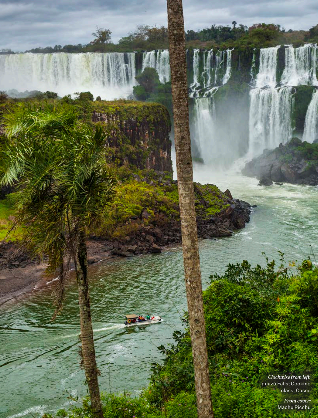
Clockwise from left: Iguazú Falls; Cooking class, Cusco Front cover: Machu Picchu