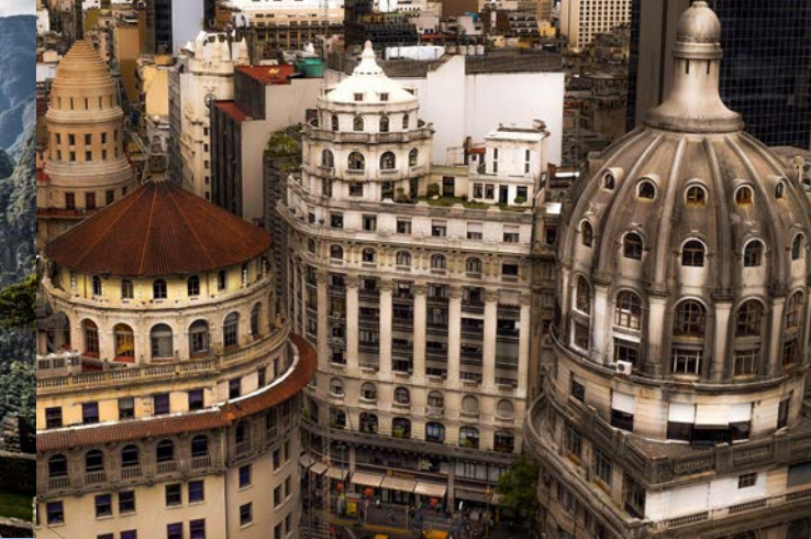
Clockwise from top left: Kayaking, Bariloche; Machu Picchu; Buenos Aires; Atacama Desert; Traditional dancers, Easter Island; Cartagena